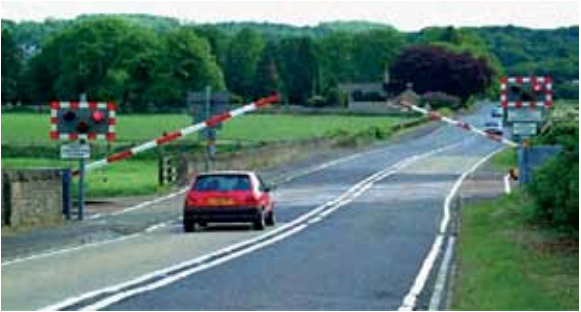
Automatic half-barrier level crossing